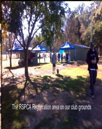
The RSPCA Registration area on our club grounds