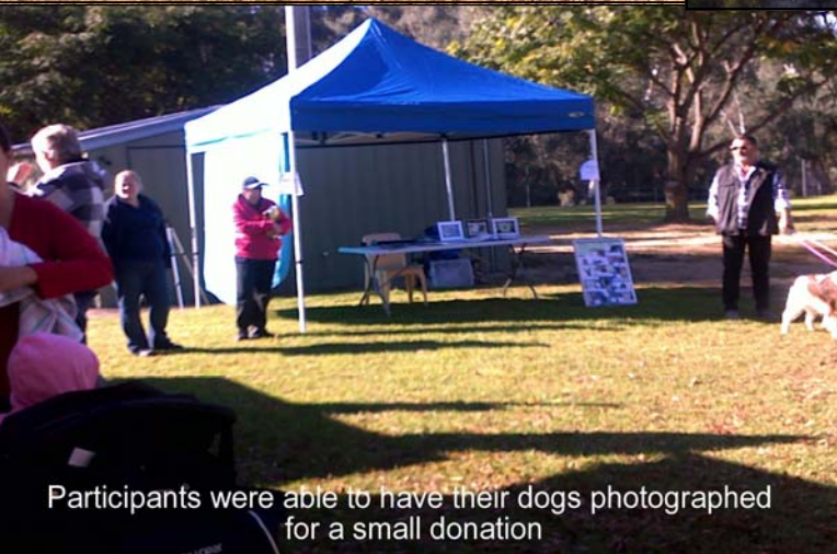
Participants were able to have their dogs photographed for a small donation