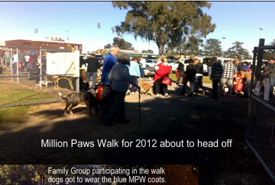
Million Paws Walk for 2012 about to head off