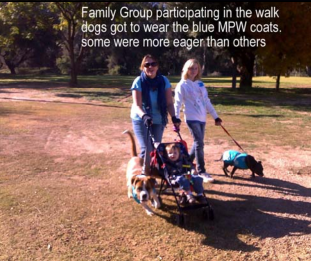
Family Group participating in the walk dogs got to wear the blue MPW coats. some were more eager than others