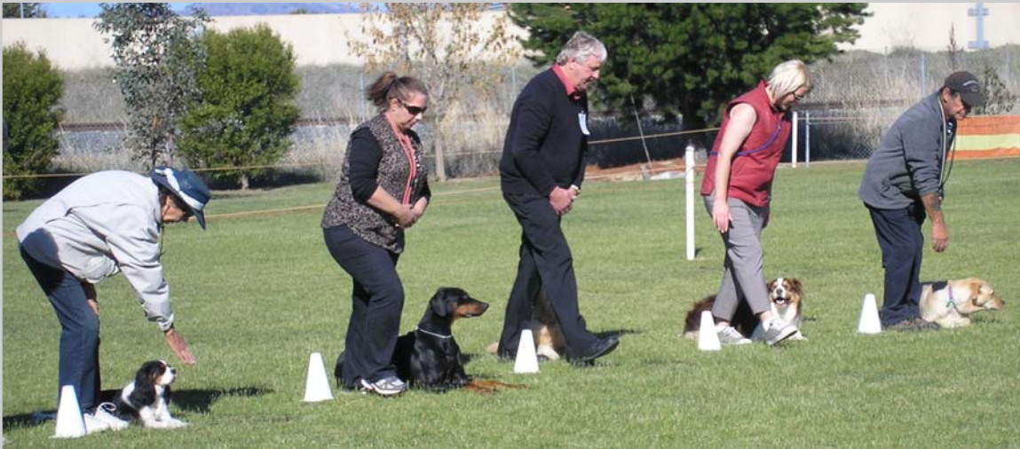
Handlers leave their dogs in the down-stay.

In CCD, Novice and Open, sit and down stays are performed. In CCD and Novice handlers are in the ring at 10m and 12m respectively. In Open and in Utility, handlers leave their dogs in the ring and go out of sight. All dogs need plenty of group practice to confidently remain in position in a line of dogs, many of whom they won't know. This is an exercise well worth taking your time over - once 'broken' stays can be very hard to 'fix'.