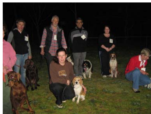
The advanced class at 8pm.

Albury, so keep up the good work, you can do it.